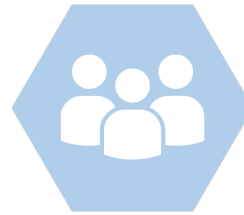
Table Top Space $1,250

Located inside main general session meeting room: